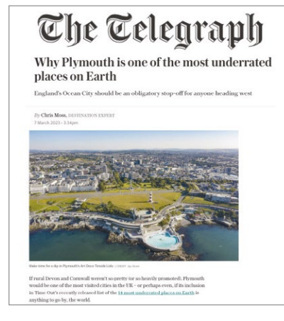
The Telegraph: Why Plymouth is one of the most underrated places on Earth 2023

Our ongoing PR activity has also built Plymouth's profile, ensuring great accolades for the city such as Condé Nast Traveller naming Plymouth one of the best holiday destinations for 2020 and Time Out & The Telegraph naming Plymouth one of the most underrated places on Earth in 2023.